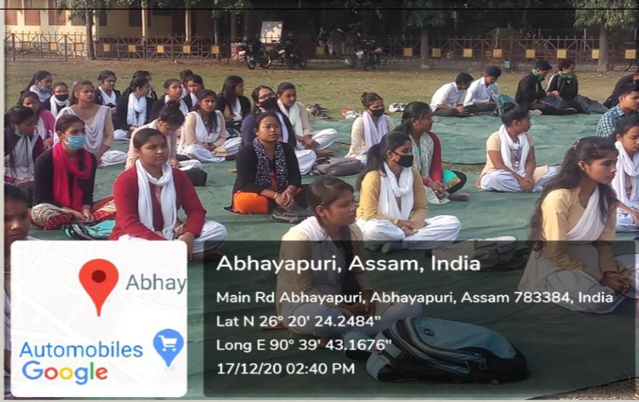
Photo: Yoga Training 17/12/2021